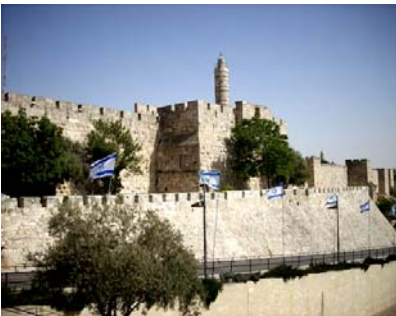
The Walls of Jerusalem

Autumn is a time of homecoming. It is a time of harvest. It is no fluke that we celebrate Thanksgiving in November. Things are ending. In our northern hemisphere, much in nature is dying. Winter is on its way.