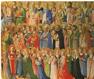
All Saints Fra Angelico 15th Century

When we are baptized we become part of the Body of Christ, the Church. We die and rise with Christ in baptism, which you might say is our “first death.” And in faith, we believe that the end of our earthly life is not the final chapter. By Christ’s death and resurrection, the gates of paradise have been opened for us. If we are faithful, we will enjoy life everlasting praising God with all the angels and saints!