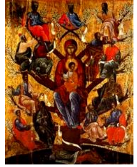
The Tree of Jesse Iconographer: Michael Damaskinos Early 17th Century St. Catherine’s Church Heraklion, Crete

Do we have other ancestors in faith? We most certainly do! Millions of them, as a matter of fact! Who are they? What are their names? Some of the names we know and some we do not. Some of these people are our blood relatives. Some are not. We are part of a very large faith family with a very long history. We are part of the Communion of Saints!