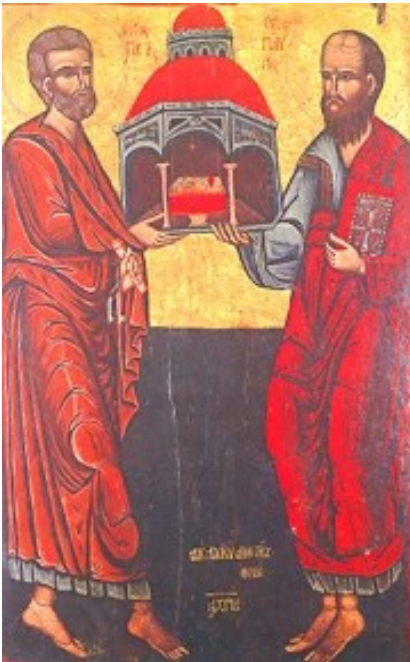
Holy Apostles Peter and Paul (Bulgarian, 1684) Annex for Old Bulgarian Art, National Art Museum, Sophia

On June 29 each year we celebrate the Solemnity of Saints Peter and Paul, Apostles. A solemnity is the highest ranking feast day on our Roman Catholic Liturgical Calendar. These first century men were leaders of our Church. Saint Peter, known as the “Prince of the Apostles,” was one of the original twelve apostles chosen by Jesus, and we also celebrate him as our first pope. Saint Paul never met Jesus prior to Jesus’ death and resurrection, but had a conversion experience with the risen Christ which was the basis of Paul’s conversion from a persecutor of Christians to the “Apostle to the Gentiles.”