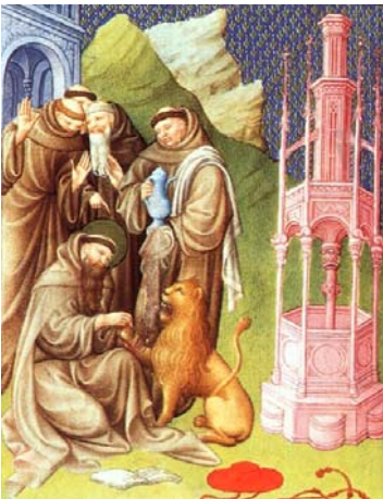
St. Jerome Extracting a Thorn Limbourg brothers Circa 1408, France

St. Jerome even began a Scripture study group for women, which was unheard of in his day and age. But he knew the power that the Bible had to change people's lives. One of his sayings was, "Ignorance of Scripture is ignorance of Christ."