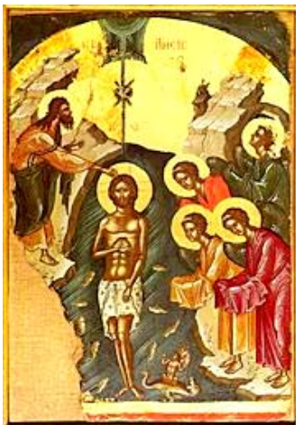
Theophany Early 17th Century Greek

The baptism of Jesus is a significant event. Mark's Gospel, the earliest Gospel written, begins with the preaching of John the Baptist and the Baptism of Jesus. In all three synoptic Gospels (Matthew, Mark and Luke), at the baptism of Jesus the spirit of God descends like a dove upon Jesus and a voice from heaven pronounces Jesus to be my beloved Son . In these three Gospels, it is immediately following Jesus' baptism that he is tempted by Satan, and it is immediately after this temptation that Jesus begins his public ministry.