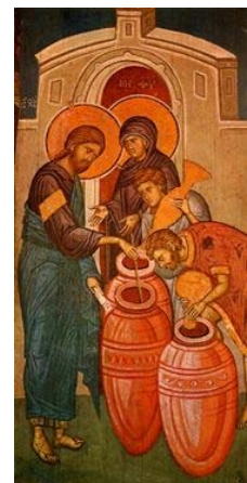
Christ Changing Water into Wine 14th Century, Serbian

A wonderful hymn with which to celebrate these manifestations at Epiphany is Songs of Thankfulness and Praise (text by Christopher Wordworth). Raise your voice in thankfulness and praise on this merriest day of the Christmas Season - Epiphany!