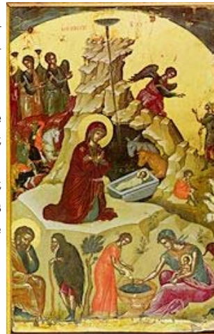
The Nativity of Christ Mid 16th Century Iconographer: Theophanes the Cretan

So, we know that Christmas is more than a day; it's even more than Twelve Days; it's an entire season!