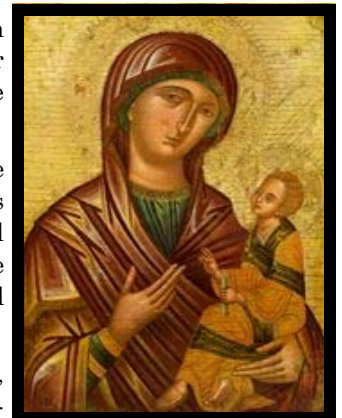
Theotokos with Christ Child 12th Century; Iconographer: St. Alpyy of the Kiev Caves

On January 1st, the octave day of the Nativity of the Lord, we celebrate the Solemnity of Mary, the Holy Mother of God. Being a holy day of obligation, we are provided with a wonderful opportunity to come together as a people of faith to keep the Feast! Holy Mary, Mother of God, pray for us!