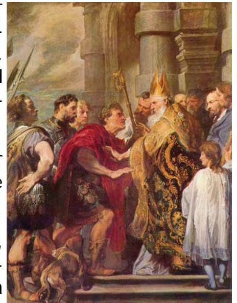
Saint Ambrose forbids Emperor Theodosius I to enter the Church Anthonis van Dyck, 17th Century

Saint Ambrose is also the patron saint of bees, beekeepers, and wax workers. In art, Saint Ambrose is often depicted with a bee or beehive. Recall that he was called the honey-tongued preacher because of his preaching