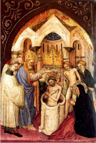
Augustine Baptized by St. Ambrose Nicolo di Pietro, 1415

was very influential in their lives. Ambrose was Monica's spiritual guide. When she became confused at the difference in the practice of fasting in Rome from her native North Africa, she asked Ambrose for advice. He told her that when in Rome you should do as the Romans do! We still use this saying today. And eventually, Augustine was baptized by Bishop Ambrose.